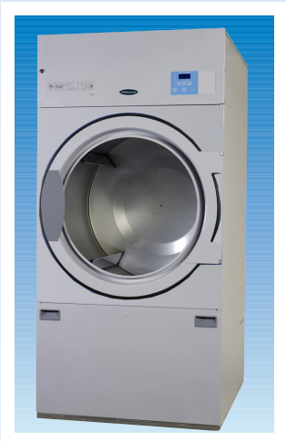
TD Series Wetclean Dryer models. Available in 30, 50, 75, 100 and 135 lb. capacities.

Drycleaners: install the environmentally-safe Wascomat Wetclean System for cleaner, brighter and softer garments - and reduce your operating costs!