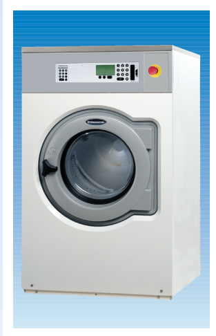
140 G-Force Extract, Solid-Mount SUPER Wetclean models. Available in 20, 30, 40, 55 and 75 lb. capacities.