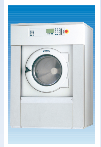
300 & 350 G-Force Extract, Soft-Mount EX Wetclean models. Available in 18, 25, 30, 40, 55, 70, 100, 200 and 250 lb. capacities.