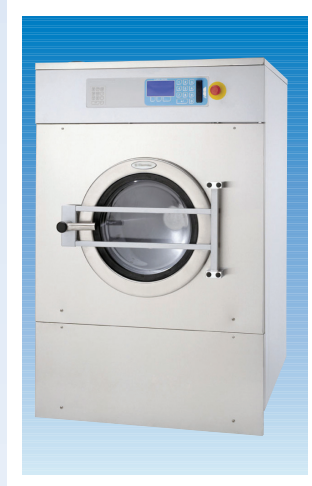
220 & 300 G-Force Extract, Solid-Mount EXSM Wetclean models. Available in 65, 80 and 135 lb. capacities.