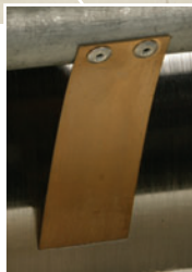
Finished Goods Fingers

Another unique advantage of UniMac is the finished goods fingers . To ensure the linens remove themselves from the heated roll without wrapping around the roll, UniMac installs a row of fingers to keep your finisher running without destroying linens.