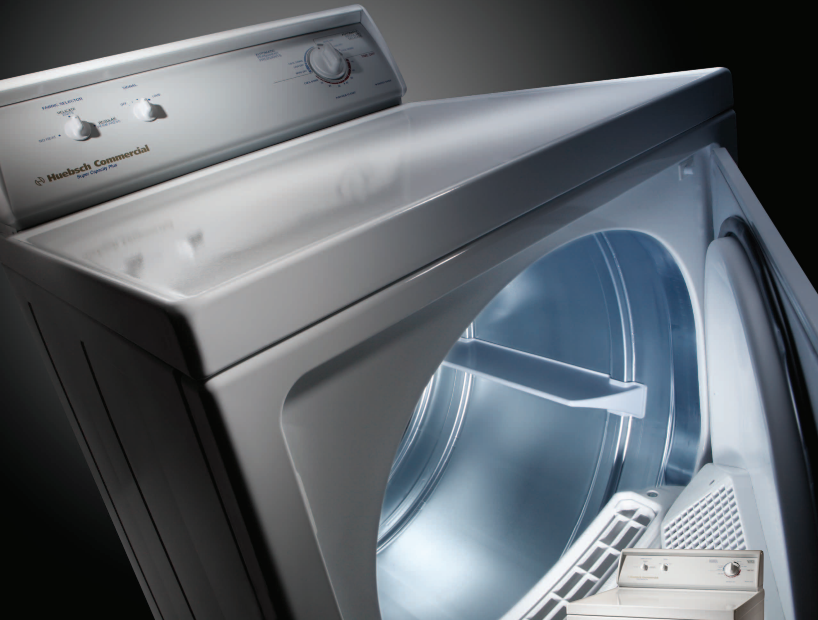
Commercial Homestyle Dryer