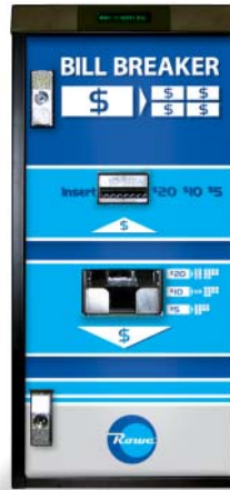
500-2 (shown) 500C1-2, 500C2-2