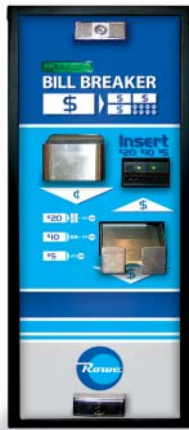
500C2-1 (shown) 500-1, 500C1-1